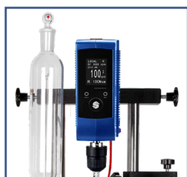
High Torque Overhead Stirrer OHS.4