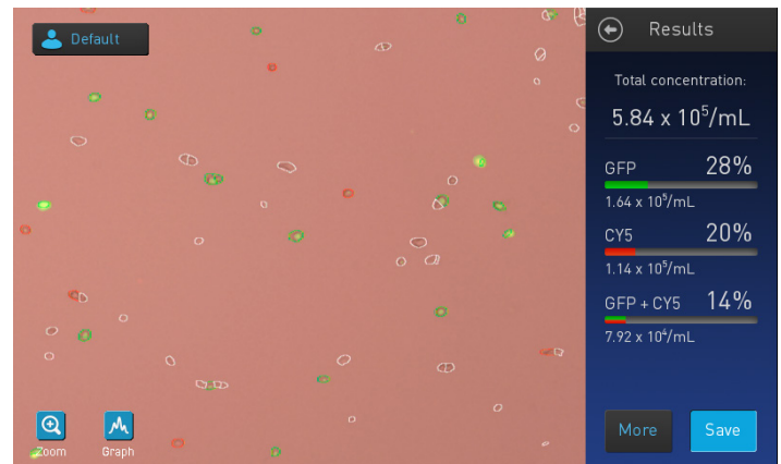
Figure 1. Apoptotic and dead cells counted on a Countess II FL Automated Cell Counter. A Countess II FL Automated Cell Counter was loaded with EVOS Light Cubes for GFP (Cat. No. AMEP4651) and Cy5 (Cat. No. AMEP4656). After incubation with 0.5 \mu\text{M} staurosporine, HeLa cells were labeled with 1:400 CellEvent Caspase-3/7 Green Detection Reagent (Cat. No. C10423) to identify apoptotic cells, and then stained with 1:1,000 SYTOX Red Dead Cell Stain (Cat. No. S34859) to denote all dead cells and incubated at room temperature for 30 minutes.

What used to take more than an hour on traditional microscopes or cytometers—simply acquiring preliminary results—now takes only a few minutes with the Countess II FL Automated Cell Counter. You can save time and effort by checking your sample before using a microscope or flow cytometer.